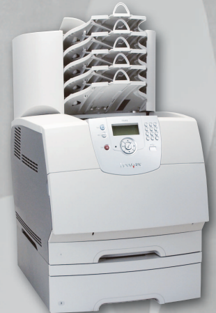
T640rn Printer With Optional 5-bin Output